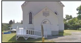
St. Patrick's Church