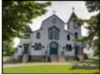
St. Anthony's Church