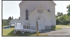
St. Patrick's Church