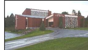
St. Theresa's Church