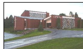
St. Theresa's Church