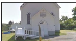
St. Patrick's Church