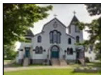
St. Anthony's Church