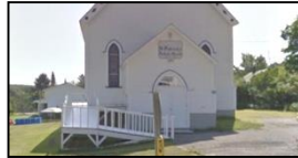
St. Patrick's Church