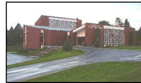
St. Theresa's Church