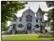
St. Anthony's Church