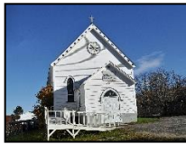
St. Patrick's Church