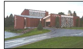
St. Theresa's Church