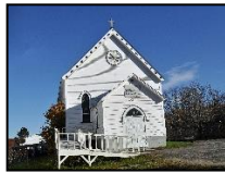
St. Patrick's Church