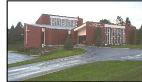
St. Theresa's Church