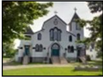
St. Anthony's Church