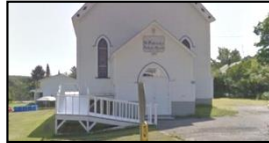
St. Patrick's Church