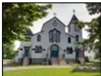
St. Anthony's Church