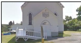
St. Patrick's Church