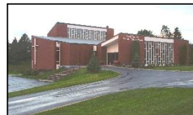
St. Theresa's Church