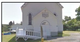
St. Patrick's Church