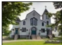
St. Anthony's Church