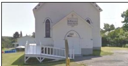
St. Patrick's Church