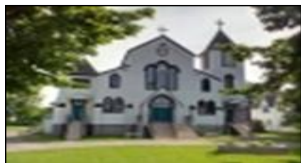
St. Anthony's Church