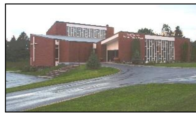
St. Theresa's Church