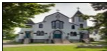
St. Anthony's Church