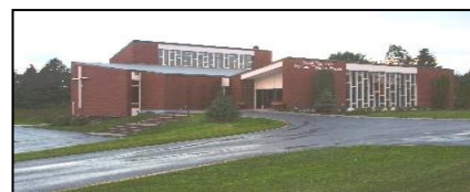
St. Theresa's Church